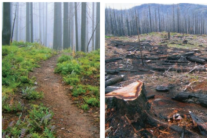
Two views of forests after the Biscuit fire of 2002 in the Siskiyou National Forest, southwest Oregon: (left) unlogged botanical reserve with legacy trees present and (right) adjacent logged area with legacy trees removed and soils damaged (blackened areas) by burning of logging slash. [Photos taken November 2005.]

Fires (6), floods (7), volcanic eruptions (8), hurricanes (9), and