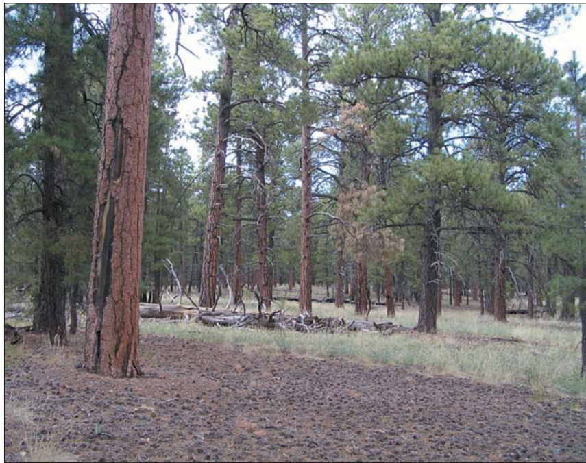
Figure 3. A restored ponderosa pine stand, Grand Canyon National Park (North Rim).

Our key findings on post-fire management are as follows. First, post-burn landscapes have substantial capacity for natural recovery. Re-establishment of forest following stand-replacement fire occurs at widely varying rates; this allows ecologically critical, early-successional habitat to persist for various periods of time. Second, post-fire (salvage) logging does not contribute to ecological recovery; rather, it negatively affects recovery processes, with the intensity of impacts depending upon the nature of the logging activity (Lindenmayer et al. 2004). Post-fire logging in naturally disturbed forest landscapes generally has no direct ecological benefits and many potential negative impacts (Beschta et al. 2004; Donato et al. 2006; Lindenmayer and Noss 2006). Trees that survive fire for even a short time are critical as seed sources and as habitat that sustains biodiversity both above- and belowground. Dead wood,