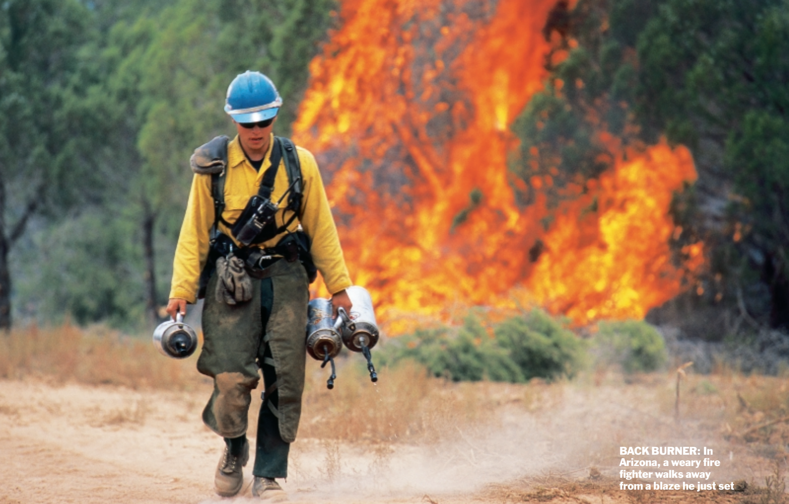
BACK BURNER: In Arizona, a weary fire fighter walks away from a blaze he just set

unlogged eight-acre plot in the Coconino that was set aside as a long-term control. Covington and his colleagues made 1876 the reference year for this plot—it was the year the last fire occurred—and then proceeded to reconstruct the way the forest had looked at the time. The difference between then and now, they found, was dramatic. In 1876 the plot boasted just more than 20 trees an acre, compared with 1,250 some 120 years later.