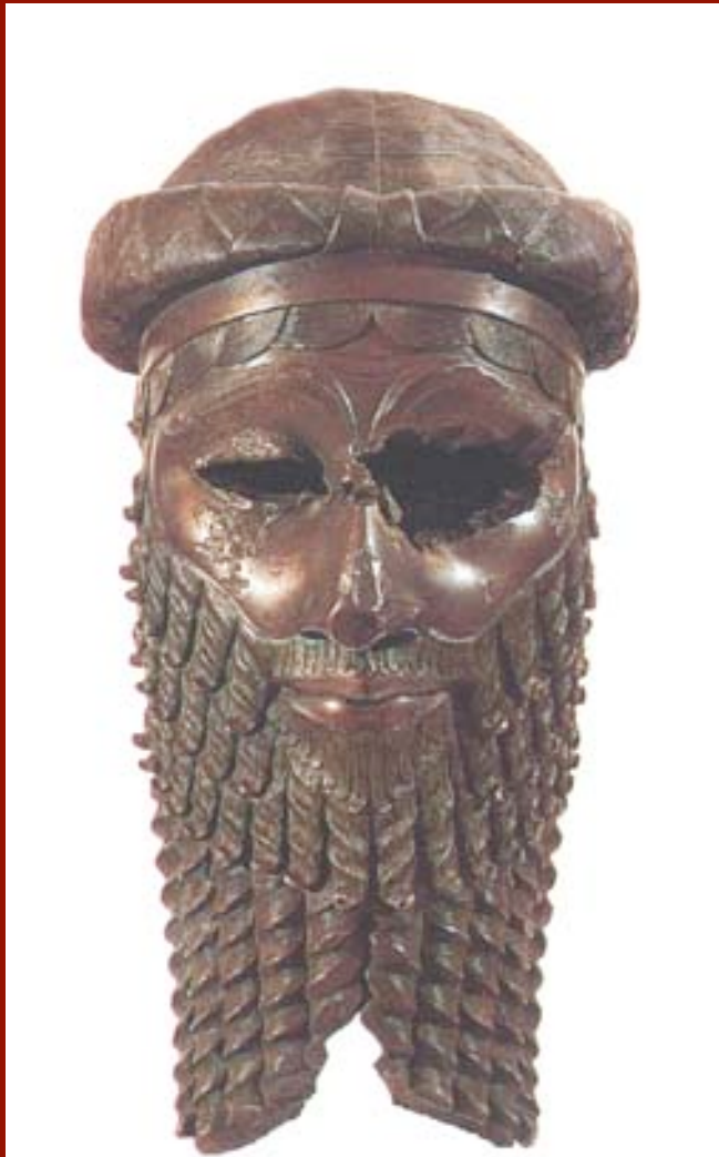
Head of an Akkadian Ruler

Head of an Akkadian Ruler, c. 2250-2200 B.C., bronze (possibly Sargon I)