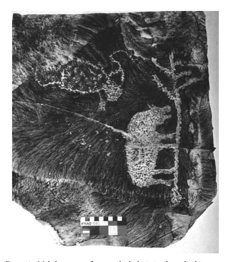
Figure 1. Mykalent copy of a petroglyph depicting bear climbing a tree and spirit figure above, at Shalabolino site on Tuba River.

Situated propitiously at the river portal of emergence (spring-fed), the clan lands (sacred rocks and trees) are identified with places for hunting wild game, fish, and waterfowl. Out of hundreds of Angara-style petroglyphs at Shalabolino, on an eastern tributary, the Tuba River, twenty-two bear petroglyphs depict brown bears in several poses, most prominently, one bear climbing a leaf-less deciduous tree (Fig. 1); two bears standing upright (poss. sow with cub) next to a natural fissure (portal) in the rock (Fig. 2); and a bear standing