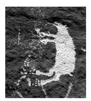
Figure 4. Close-up of "cosmic" bear in Fig. 3.

Further to the right and just off center and above the other two bears stands the visual centerpiece of the panel (Fig. 4). This more elaborately detailed, third bear is standing (or dancing) above the other two and appears to be situated at the pentacle of a forked path or tree top. While the first two bears appear to be in the process of ascending a tree, the third cosmic or spirit bear appears to have arrived at the end of its path/journey in the spirit realm. Identified as Ute from its tripartite, Uncompahgre-style paws (a Ute stylistic signature), the pecking of what appears to be liquid, breathe, or song spewing forth from its mouth suggests how the bear gives "bear medicine." A similar, although less skillfully executed glyph, appears in Nine Mile Canyon, Utah and Ute Uncompahgre-paw style "dancing" and walking bears are on a panel