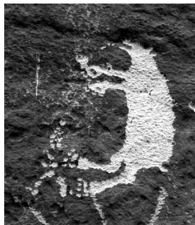
Figure 4. Close-up of “cosmic” bear in Fig. 3.

Further to the right and just off center and above the other two bears stands the visual centerpiece of the panel (Fig. 4). This more elaborately detailed, third bear is standing (or dancing) above the other two and appears to be situated at the pentacle of a forked path or tree top. While the first two bears appear to be in the process of ascending a tree, the third cosmic or spirit bear appears to have arrived at the end of its path/journey in the spirit realm. Identified as Ute from its tripartite, Uncompahgre-style paws (a Ute stylistic signature), the pecking of what appears to be liquid, breathe, or song spewing forth from its mouth suggests how the bear gives “bear medicine.” A similar, although less skillfully executed glyph, appears in Nine Mile Canyon, Utah and Ute Uncompahgre-paw style “dancing” and walking bears are on a panel