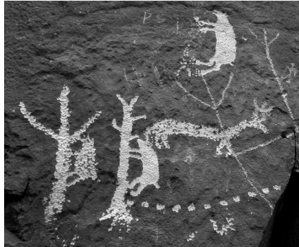
Figure 3. “Three Bears” petroglyph with Ute Uncompahgre-style pawed “cosmic bear”, Shavano Valley, western Colorado.