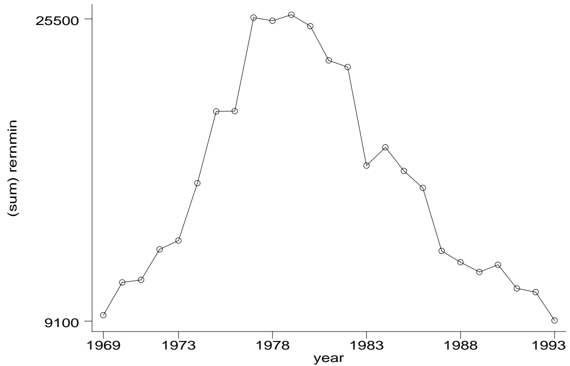
Figure 2: Total Real Earnings in the Mining Industry, 1969-93

Notes: Authors' calculations, REIS data. Graph reports earnings from the coalmining industry for Kentucky, Ohio, Pennsylvania and West Virginia. Mining earnings reported in thousands.